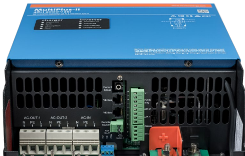
Connection Area MultiPlus-II 3k

Measures battery voltage and temperature and allows monitoring and control with a smart phone or other Bluetooth enabled device.